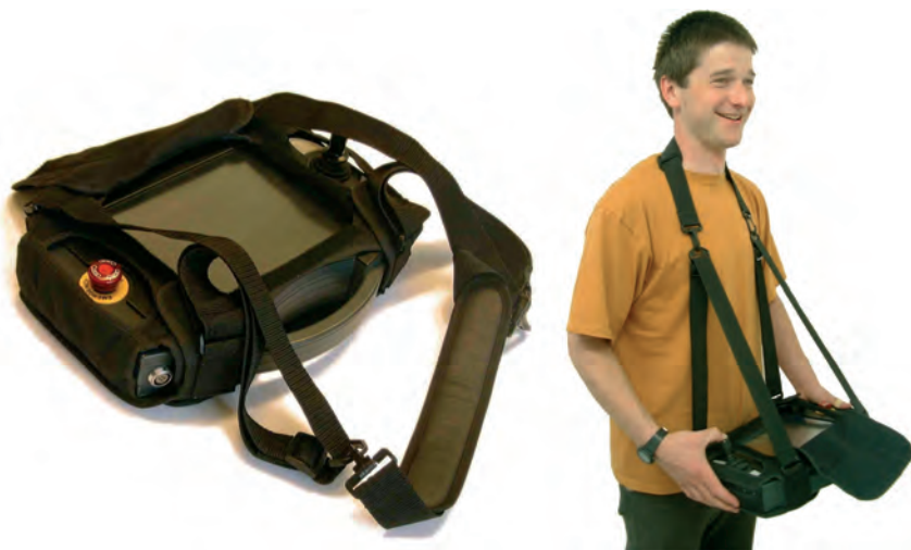
Demonstrating the CAT 100R in its halter case.

the device. In that case you connect the operating cable to the plug mounted on the unit. It is important to understand that the same desk exists in another version; the CAT 100 (without the R at the end which stands for radio transmission). And the CAT 100 works like a normal mobile desk, still very light and portable, but useable only with the cable, which can be up to 20 metres (65 ft) long.